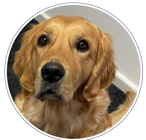
Maple Therapy Dog