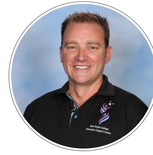
Mr Spice Transition Support